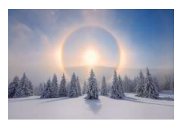
NEWSLETTER NOVEMBER 2021