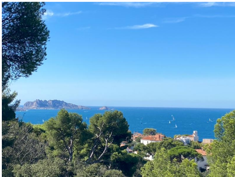
View from the Roucas Blanc parc / Vue sur la mer du parc du Roucas Blanc