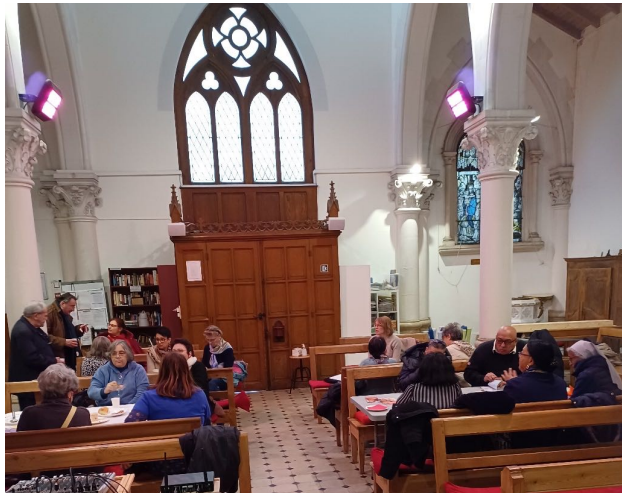
Ecumenical celebration at All Saints'

The week culminated in an ecumenical celebration at All Saints' on Saturday, 25 th January, at which we welcomed members of many denominations across the city as Catholic, Protestant, Orthodox, Baptist, Evangelical and Anglicans joined in tea, cake, prayer and singing.