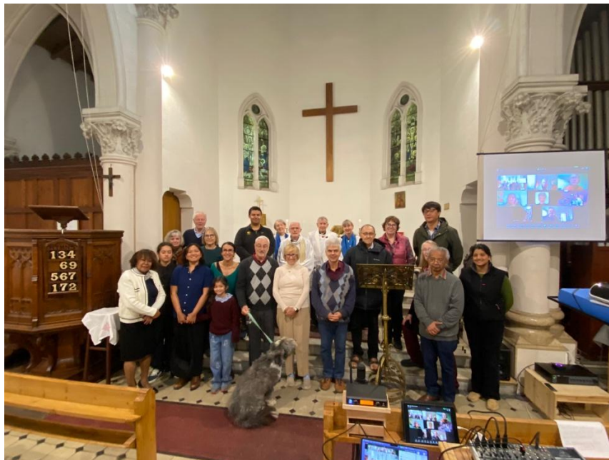
All Saints' Sunday in Marseille

As we turn toward Advent and the light of Christmas, it is good to look back on all that November has held for our church family.