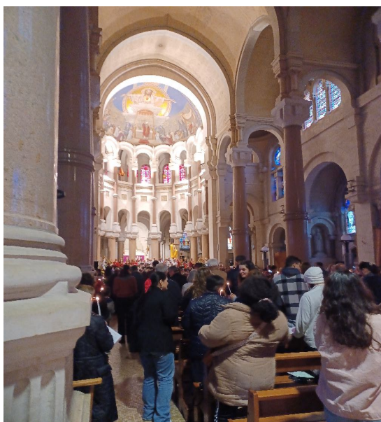
Unis pour Servir