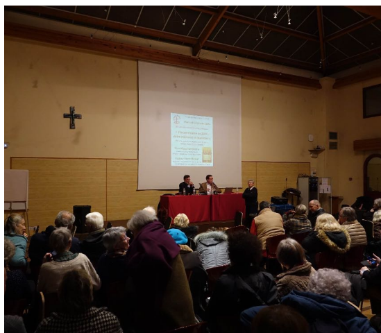
Lecture - Council of Nicaea