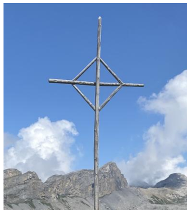
Photo : Cross near Tannalp at 2140 m on Via Alpina